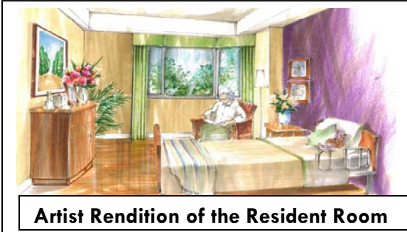
Artist Rendition of the Resident Room

As we have been sharing with you over the past 12 months, Yaletown House is preparing to launch a fundraising campaign to raise money for facility revitalization. This campaign will see the renovation of all four floors, resident rooms and outdoor gardens. Over the summer, with the help from families and past donors, we have finalized our 'Quality of Life Starts at Home' brochure which will now be shared with our philanthropic community such as corporation and foundations. As we continue to gather momentum and financial support we will be inviting our internal community, including families, residents, volunteers and staff to be part of Yaletown House's renewal plan. We hope you can join us!