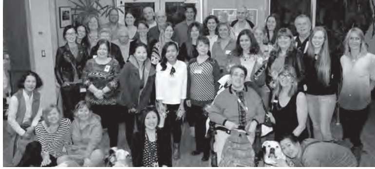
The 2017 Volunteer Team