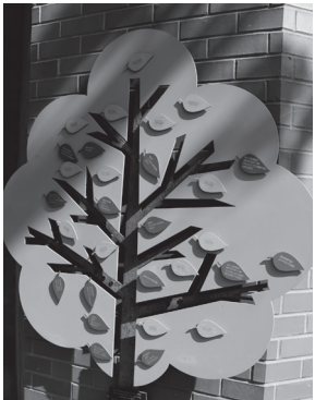
You can still donatel—today or next year!