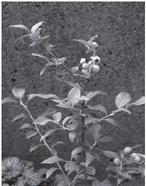
Berries are spotted on the blueberry tree

To thank our generous community, a Courtyard Garden Donor Tree was installed with each leaf announcing the major ($500+) donors. This is a growing tree that needs more leaves. We welcome donations to support ongoing horticulture therapy. Please contact Lynn Parkin at the Foundation office to have your name added.