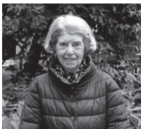
Clockwise from top left