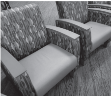
Ilona participates in the knitting program seated in one of the new comfortable chairs. 4 different styles make up the new 33 chairs in the main lounge