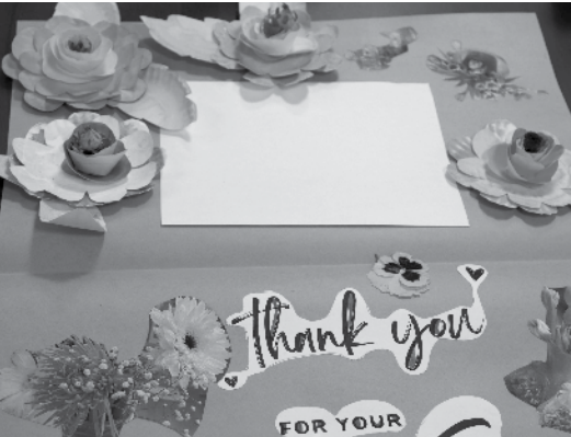
A thank you card made by the residents with help from horticulture and art programs.

Thank you, Urban Fare, for the bloom of beauty!