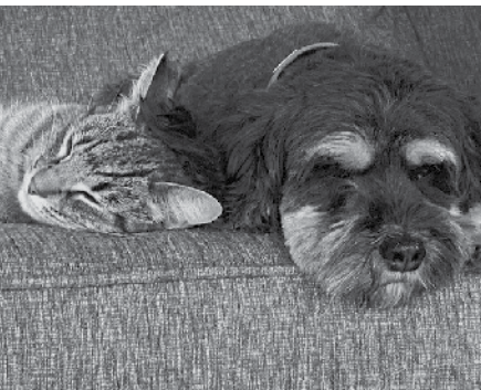
Here are some of the dynamic duos together and some solo shots of our furry friends: