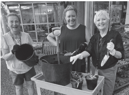
Many hands help a garden to grow