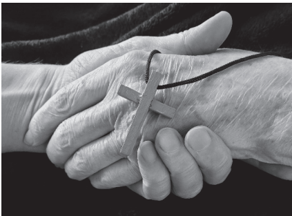
The healing and caring hands of Spiritual Care