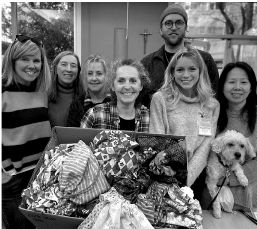
Clockwise from top: Our team of volunteer wrappers