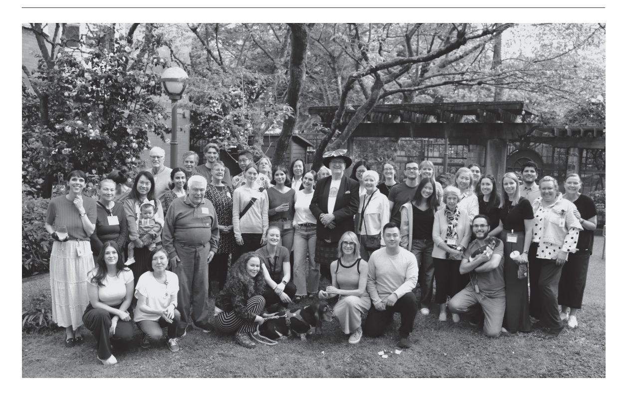
Volunteers gather at the 2025 Appreciation Event