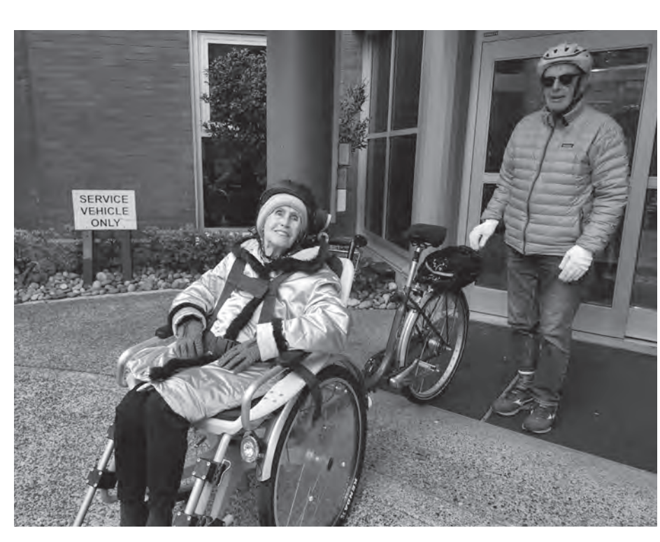
Another Duet Bike ride about to start

Go to www.yaletown.org/donate to make a gift and propel our next ride.