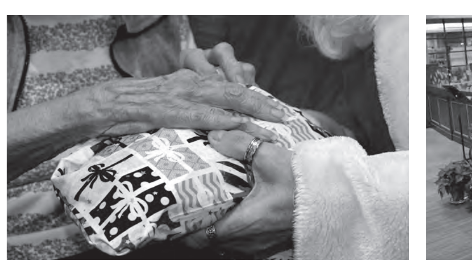
Clockwise from top right: The Recreation Team makes it happen Santa greets his waiting crowd 127 gifts were handed out Cards by Cossette